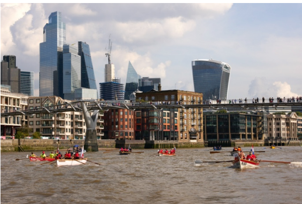
GRR 2023

The Great River Race is open to any traditional style boat powered by a minimum of 4 oars or paddles, and carrying a cox and a passenger to emulate the craft of London's Watermen, the water taxis who carried passengers across the Thames when London bridge was the only alternative.